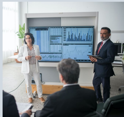
Internal Controls-optimize operational capacities