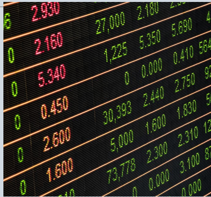
Finance & Investment