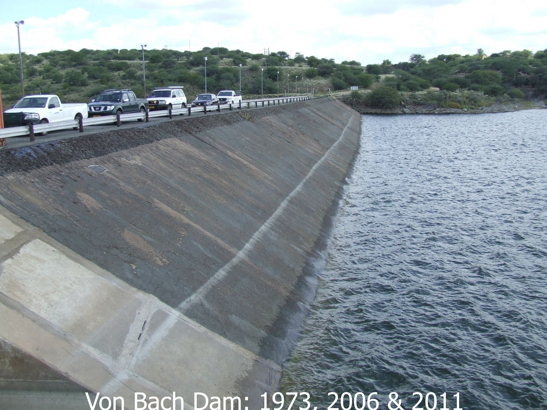
Von Bach Dam: 1973, 2006 & 2011