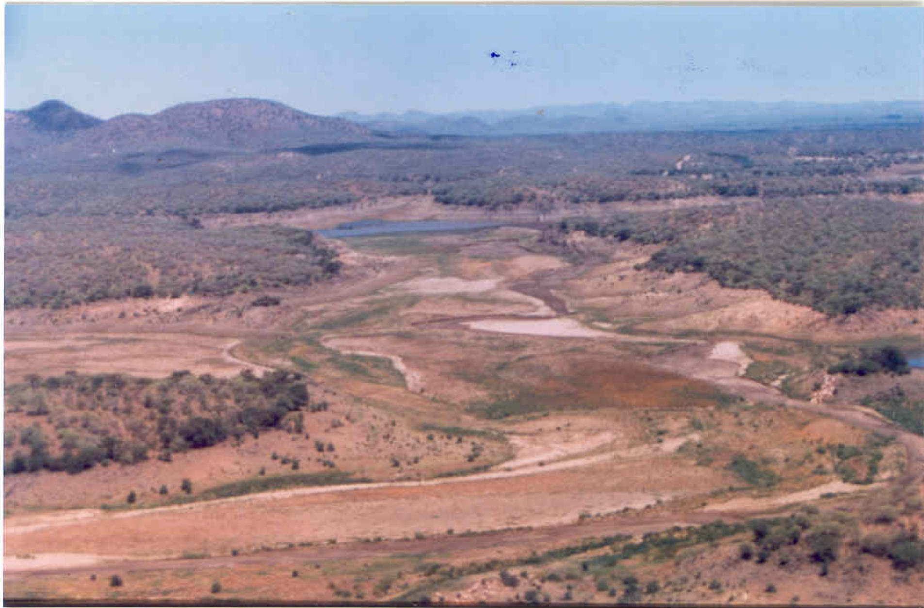
Von Bach Dam in December 1996 – 10%